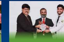
Award Distribution March 24, 2022