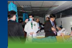
Blood Camp March 9, 2022