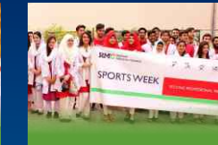
Sports Week March 21-25, 2022