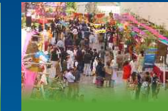
Fun Fair March 26, 2022