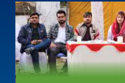
Medical Camp March 22, 2022