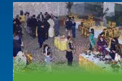
Alumni Dinner March 24, 2022