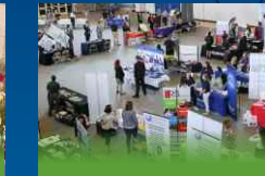
Career Fair March 28, 2022